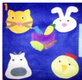
Figure 2. Animal feeding activities

that influence the quality of education. The results of the observations of researchers, the teacher named Mrs. Dewi looks very deft in making Fun Book Learning media, from how to provide ideas to create activities from indicators that have been selected according to the 2013 curriculum for ages 4-5 years. For example in KD 1.2 Respect for yourself, others, and the environment as gratitude to God, the idea that comes out is the activity of feeding animals as shown below: